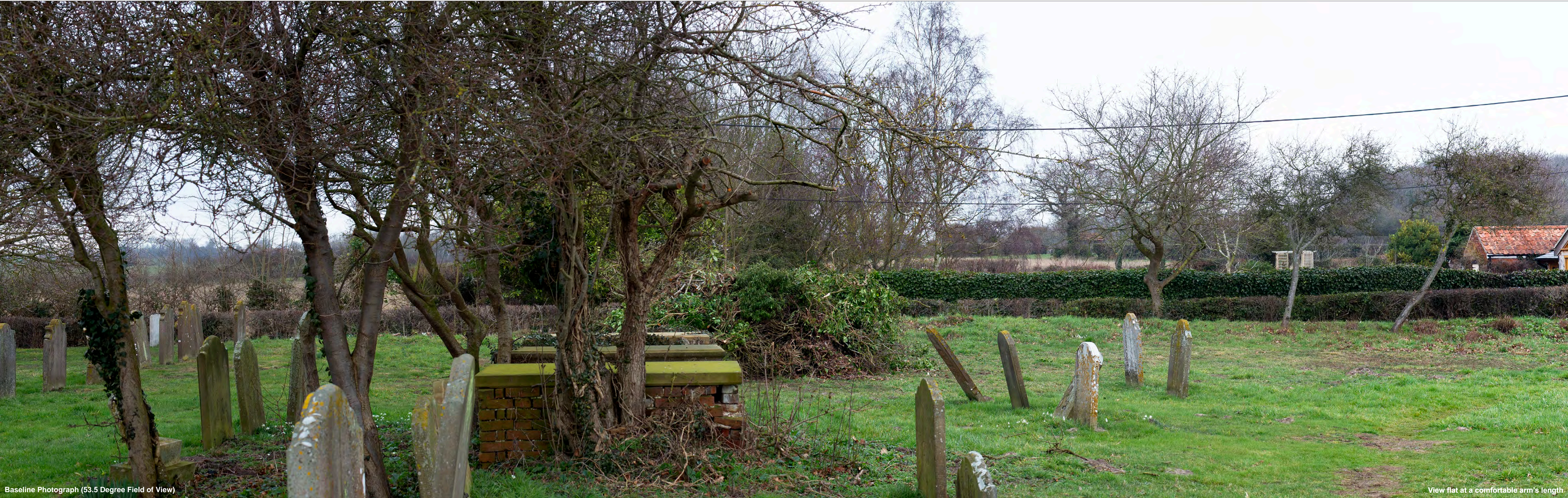
Baseline Photograph (53.5 Degree Field of View)