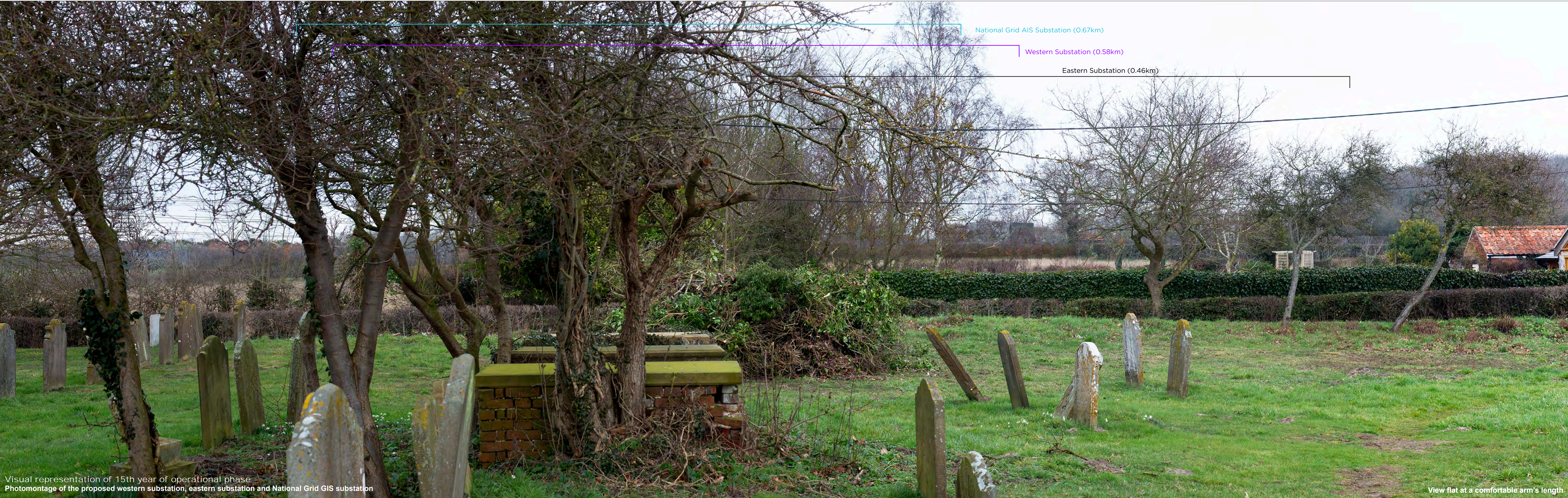
Visual representation of 15th year of operational phase Photomontage of the proposed western substation, eastern substation and National Grid GIS substation