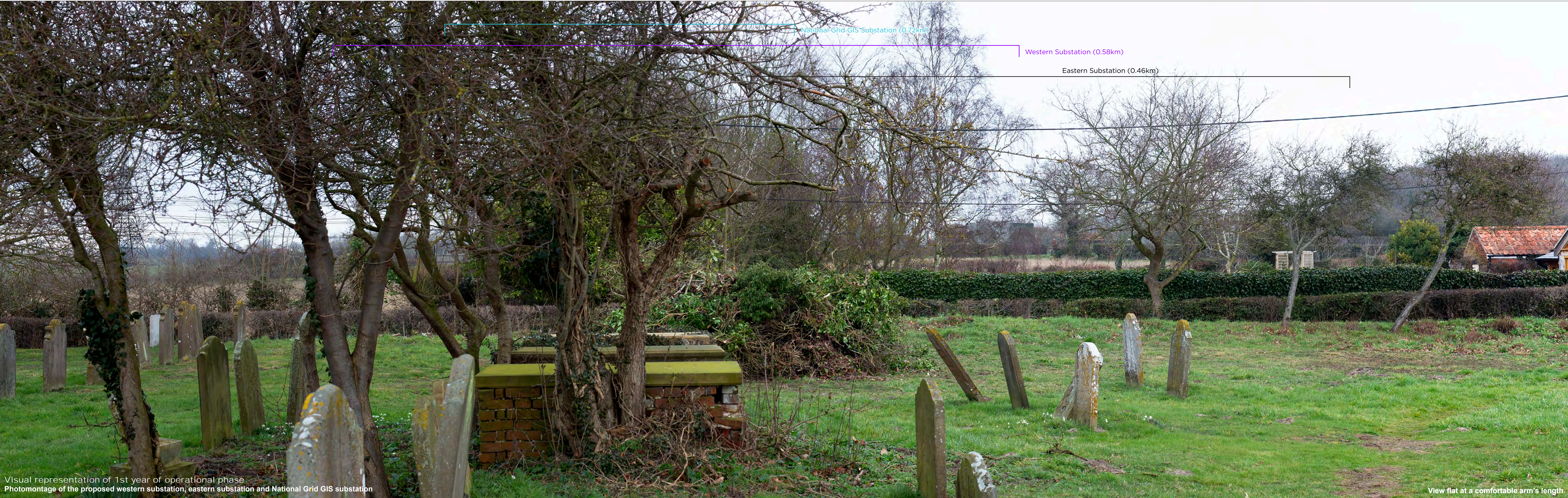
Visual representation of 1st year of operational phase Photomontage of the proposed western substation, eastern substation and National Grid GIS substation